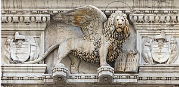
Courtyard of the Doge's Palace (Venice) – Scala dei giganti – Lion of Saint Mark